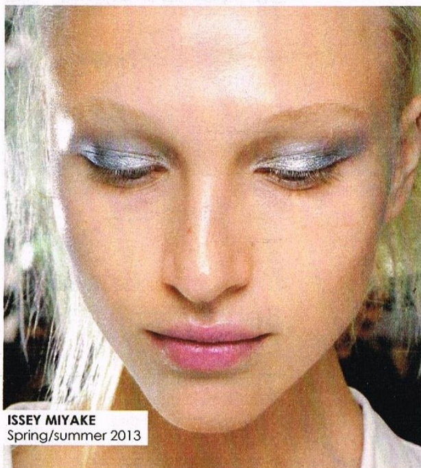
ISSEY MIYAKE Spring/summer 2013