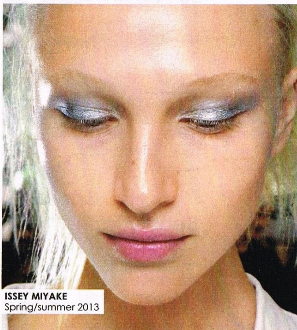
ISSEY MIYAKE Spring/summer 2013